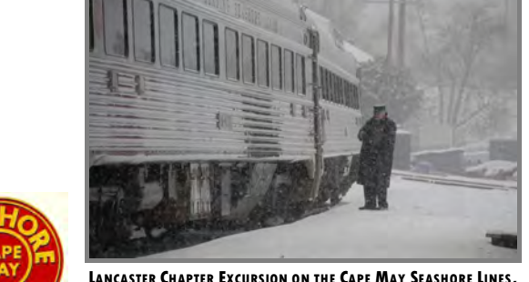
LANCASTER CHAPTER EXCURSION ON THE CAPE MAY SEASHORE LINES, TUCKAHOE, NJ AWAITING DEPARTURE SOUTH TO WOODBINE, NJ SATURDAY, JANUARY 30, 2010