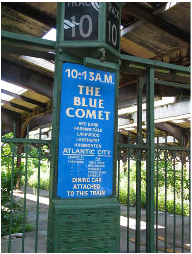
THE BLUE COMET DESTINATION BOARD AT THE CENTRAL RAILROAD OF NEW JERSEY'S COMMUNIPAW TERMINAL IN JERSEY CITY, NEW JERSEY