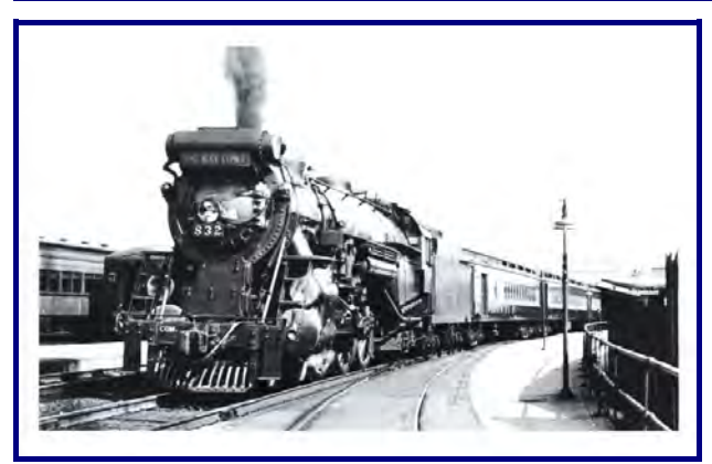
CLASS G3 PACIFIC No. 832 DEPARTING ATLANTIC CITY WITH TRAIN No. 4266. CIRCA 1936