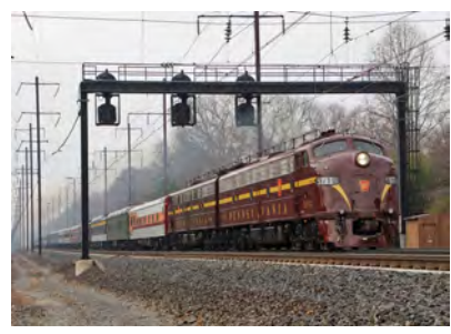
2010 LIBERTY LIMITED PASSES BOWIE, MD. ENROUTE TO PHILADELPHIA, PA.

way from Washington D.C. to the 2010 Army-Navy football game in Philadelphia.