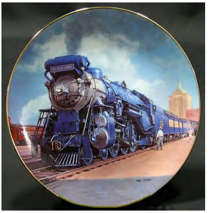
THE BLUE COMET COMMEMORATIVE PLATE BY NOTED ARTIST TED XARAS