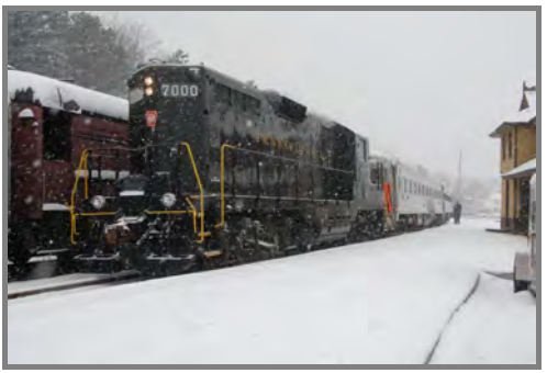
LANCASTER CHAPTER EXCURSION ON THE CAPE MAY SEASHORE LINES, TUCKAHOE, NJ - SATURDAY, JANUARY 30, 2010

Phone: 717-347-7637 Please keep our Chaplain informed of member news