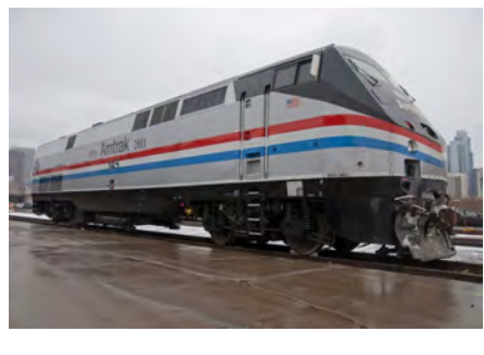
<u>First Amtrak Locomotive in Historic Paint Scheme Kicks Off Year-Long</u> <u>40th Anniversary Celebration</u>

AMTRAK P42 No. 145 SHOWS OFF ITS RETRO PAINT SCHEME IN CHICAGO ON JAN. 31.