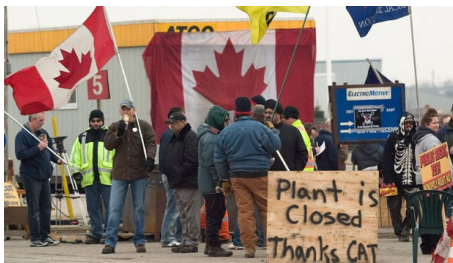
CAW WORKERS PICKET OUTSIDE AT THE ELECTRO-MOTIVE PLANT IN LONDON, ONT., ON FEB. 3, 2012.

The move comes after EMD locked out union workers at the plant on Jan. 1 when the current labor agreement expired. EMD had asked workers to take a 50 percent reduction in pay, a move that was rejected by the