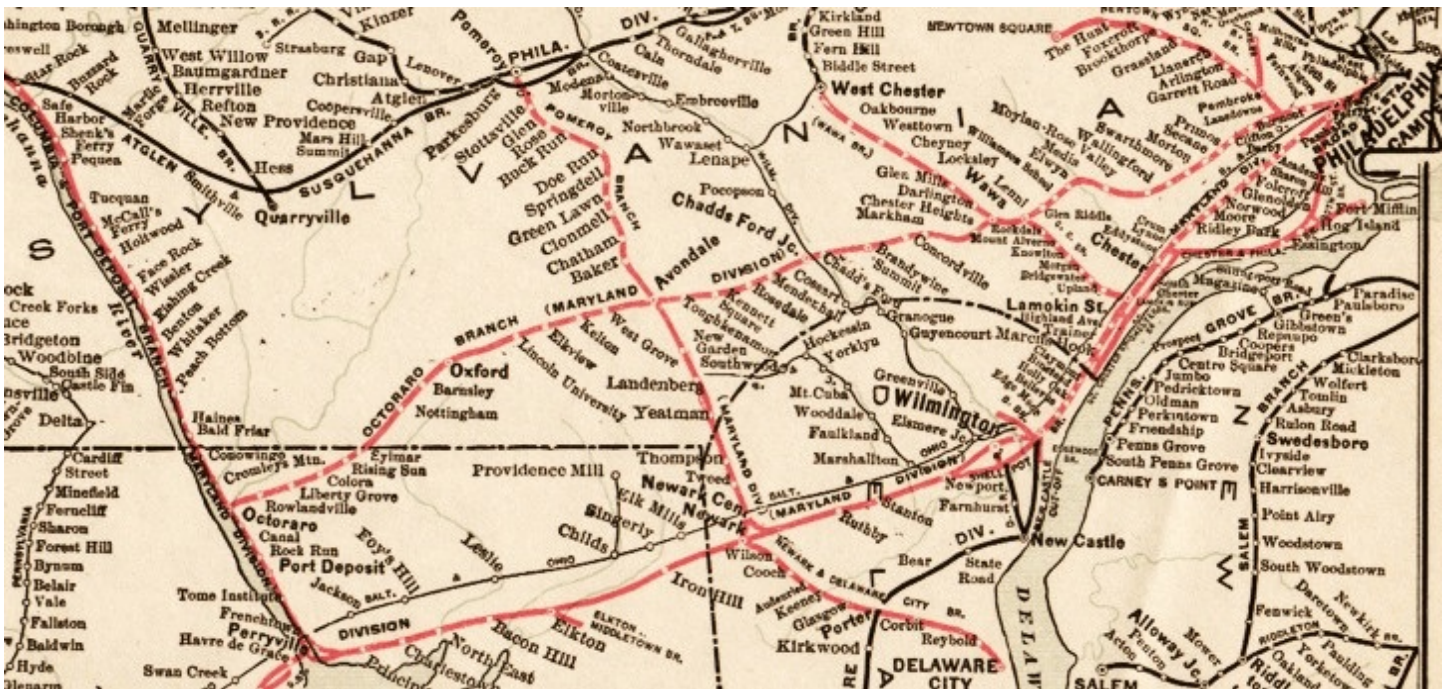
OCTORARO BRANCH SHOWN ON A 1920 PENNSYLVANIA RAILROAD MARYLAND DIVISION MAP