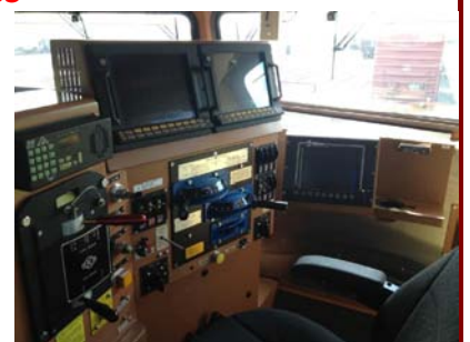
PHOTO OF THE ENGINEER'S CONTROL STAND OF NORFOLK SOUTHERN HERITAGE LOCOMOTIVE No. 8102, PAINTED IN PENNSYLVANIA RAILROAD COLORS. NOTE THAT MODERN-DAY SCREENS HAVE REPLACED GAUGES.