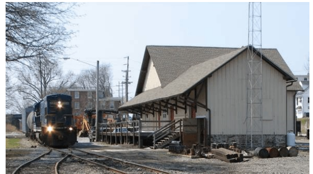
KENNETT SQUARE STATION IN MARCH, 2007

Facing financial difficulties, construction of the rail line was limited to construction of the roadbed until circa May 1859 when track was laid and locomotives ran as far as Concordville. Stage coach service connected Concordville to Kennett Square at that time. In mid November 1859 trains began crossing the Brandywine Creek. Train service arrived at Kennett Square on December 17, 1859 amid great fanfare. A schedule for December 24, 1859 shows two trains from Kennett Square and two passenger trains to Kennett Square were in operation daily to and from Philadelphia.