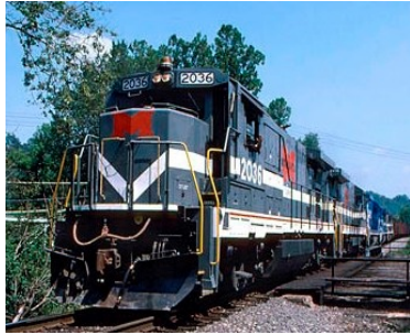
CONRAIL GE B23-S7 No. 2036 (EX-MONONGAHELA No. 2306), FORMER WESTERN PACIFIC U23B No. 2251 - PHOTO BY WADE MASSIE

The remaining eight Norfolk Southern Heritage diesels should be painted by the end of June. All 20 will gather for a "family portrait" at the North Carolina Transportation Museum in Spencer, N.C. on July 3-4. [TRAINS News Wire - Photo by Casey Thomason, Norfolk Southern Corp.]