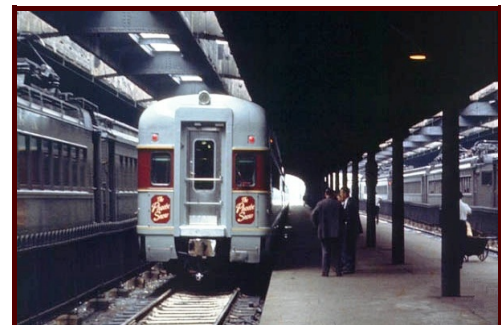
DELAWARE LACKAWANNA & WESTERN "PHOEBE SNOW" NOVEMBER 15, 1949 - NOVEMBER 27, 1966