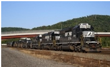
NS SD40-2 No. 3354 and SD60 No. 6647 lead 13 former Norfolk Southern locomotives at Altoona, Pa. They locomotives are part of an exchange with National Railway Equipment for 24 SD40-2s.

and at VMV in Paducah, Ky. The first group to arrive on Norfolk Southern property included Nos. 3468, 3469, 3484, 3486, and 3490. All five locomotives were forwarded to the railroad's Chattanooga, Tenn., shop. They reportedly will be repainted and placed into service.