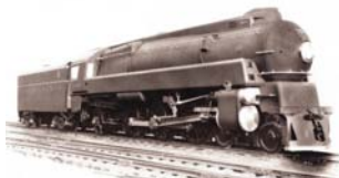
PRR No. 1120 BUILDERS PHOTO E.12729 - 12-14-40

Nov. 2, 1930 - All remaining outbound steam trains from Broad Street Station to northern and western points rerouted through upper level of 30 th Street Station instead of West Philadelphia Station.