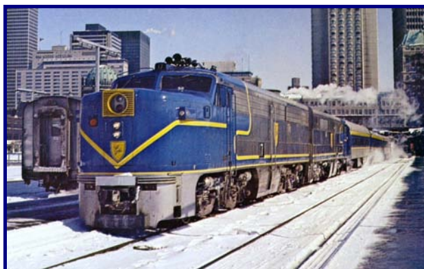
DELAWARE & HUDSON RAILWAY ALCO PA No. 17 ON THE ADIRONDACK AT MONTREAL, QUEBEC - FEBRUARY 1977.