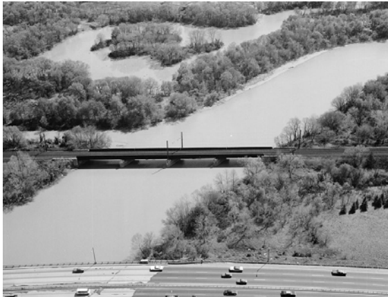
LOOKING SOUTH AT THE AMTRAK ANACOSTIA RIVER BRIDGE WITH THE NEW YORK AVENUE BRIDGE IN THE FOREGROUND - 1977.

"How any of us got out is more than I can understand. I was in the coach that broke through the trestle and dropped into the water. My first recollection is of standing on the window of my berth hanging from the curtain rod. We (the man in the next berth) heard water rushing all around us. The porter eventually opened the window and they escaped."