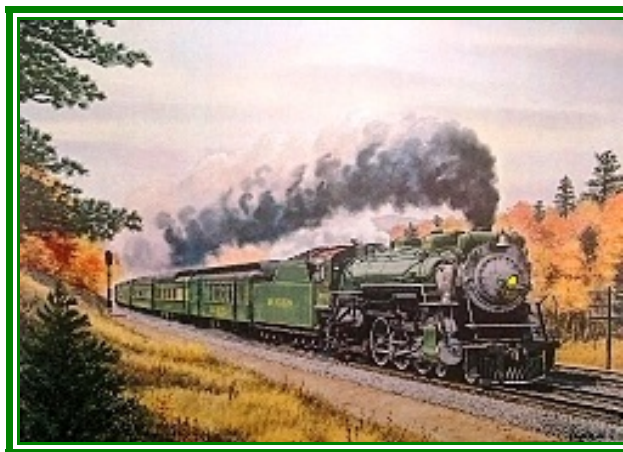
PAINTING BY HOWARD FOGG DEPICTING THE SOUTHERN RAILWAY'S CRESCENT LIMITED AT SPEED, POWERED BY PS-4 No. 1401.

[Article from Ghosts of DC and Wikipedia]