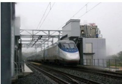
AN ACELA EXPRESS TRAIN PASSES THE NEW NIAN TIC RIVER BRIDGE IN EARLY JUNE 2013

NEW YORK - June 24, 2013 - Amtrak has completed the three-year Niantic River Bridge Replacement Project which provides improved operational reliability for rail passengers along the Northeast Corridor with increased train speeds, less disruption to the boating community and expanded beach access to area residents.