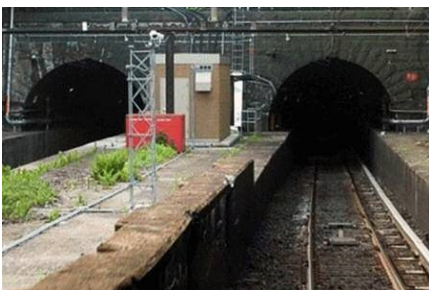
THE EXISTING HUDSON RIVER TUNNELS ARE MORE THAN 100 YEARS OLD AND REQUIRE SERVICE OUTAGES EVERY WEEKEND TO PERFORM ROUTINE MAINTENANCE - AMTRAK