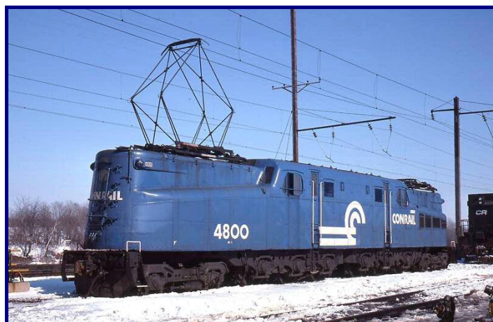
CONRAIL GG1 4800, "OLD RIVETS" AT MORRISVILLE YARD, PENNSYLVANIA ON FEBRUARY 11, 1978.

MONDAY EVENING, DECEMBER 16, 2013 at 7:30 PM