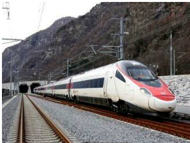
EURO CITY AT THE SOUTH PORTAL OF THE GOTTHARD BASE TUNNEL

Sunday, Dec. 11, 2016 was the opening of one of the world's engineering marvels: the Gotthard Base Tunnel under the Swiss Alps, the world's longest and deepest railway tunnel.