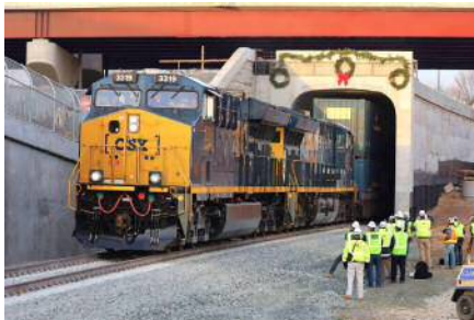
RAIL OFFICIALS GREETED TRAIN Q135-22, POWERED BY CSX ET44AH No. 3319, AS IT EXITED THE TUNNEL ON THE MORNING OF DEC. 23 - EDWARD KERNS II PHOTO.

The Virginia Avenue Tunnel is the last of 61 clearance projects that comprise the $850 million National Gateway Initiative, an innovative public-private partnership announced in 2008 to create more-efficient pathways for rail freight between key U.S. markets through investment in critical transportation infrastructure.