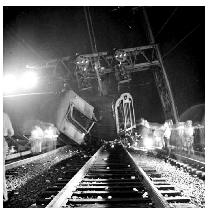
SCENE FROM THE 1943 CONGRESSIONAL LIMITED TRAIN WRECK IN PHILADELPHIA.

Strangely, both trainweb.org and pinterest tagged the incorrect photo as the derailment of the Congressional Limited .