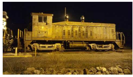
SRC 1235 AT NORFOLK SOUTHERN'S H.CRAIG LEWIS (DILLERVILLE) YARD ON SEPT. 20, 2018 - RYPN.ORG

STRASBURG, PA, Sept. 21, 2018, Trains News Wire - The Strasburg Rail Road has acquired another diesel locomotive to bolster its burgeoning freight business. This one is an ex-ATSF SSB-1200, rebuilt from a 1953 EMD SW9. The unit was last in use at the Celanese plant at Narrows, Va.