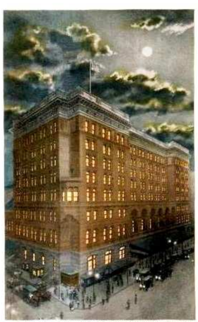
PHILADELPHIA & HEADING R. R. STATION PHILADELPHIA PA