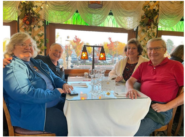
Upon boarding, happily enjoying the elaborate Garden Café Car