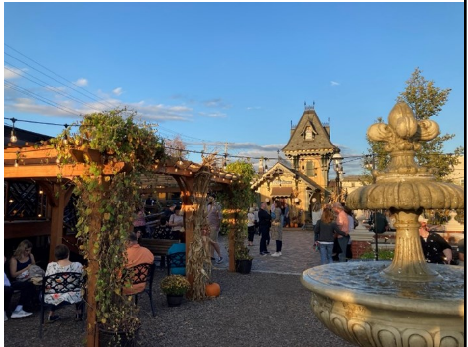
The boarding area and station at Boyertown

We boarded by our car type. The train had a deluxe coach, a dining car, two lounge cars a parlor car, plus an open-air car. Our car was a classic 1920's lounge-dining car called the "Garden Café". We entered to find a beautifully decorated (with flowers and drapery) coach with tables for four on one side and two on the other (right) side. We found our table (#7 Donohue party). After taking our seats, the leading GP-38 in Norfolk Southern colors blew its loud horn and we started southward from the terminal. The line runs about 8 ½ miles south to the junction of the former Reading Main Line (Philadelphia to Reading) at Pottstown.