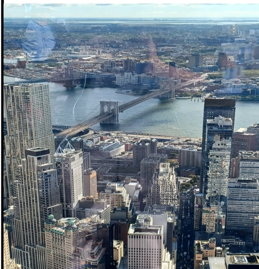
Above: The Brooklyn Bridge. Center: View of the Tower from the entrance. Right: The Stature of Liberty, of course.