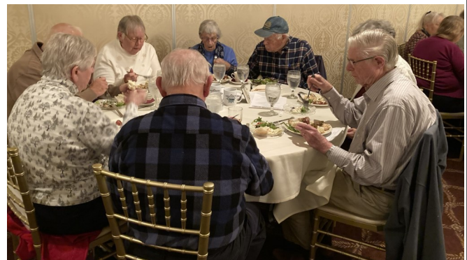
Above: Members enjoying the excellent meal at The Willows banquet facility.