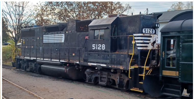
One of the workhorses of the Colebrookdale an ex-NS, ex-Southern GP38-2. An ex-PRR GP9 pulls most of the excursion trains.