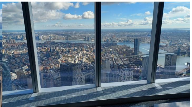
The view from the tower toward the East River.