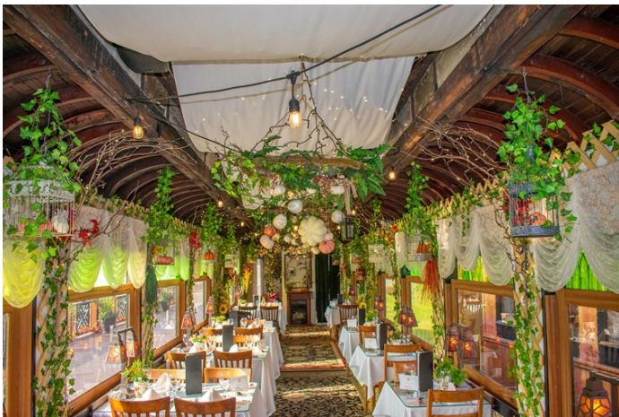
Interior of the Garden Café Car

About ten minutes before reaching the end of the trip, the train stopped suddenly dumped the breaks and came to a hard stop! We later found out that a group of teenagers had stolen one of the rail bikes and had pedaled out about a mile or so to that point of the line. Then unable to turn around on the single track they abandoned the bike at that point, which blocked our return to the station. Several of the train's crew members had to pedal the bike back to Boyertown before we would be cleared to continue. That took about 15 minutes and then we proceeded the final mile into Boyertown Station, arriving about fifteen minutes late. All and all a fun trip!