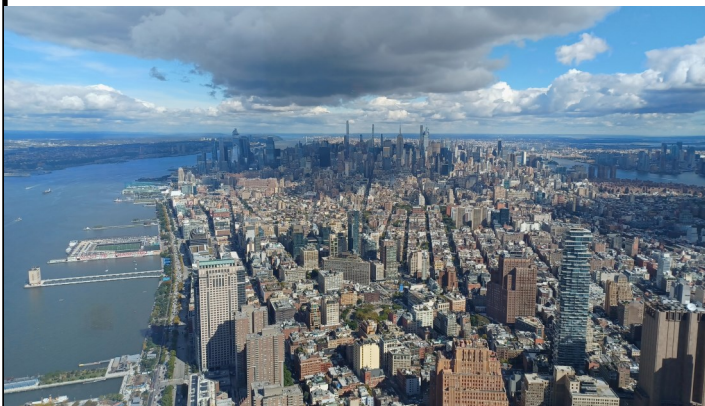
The iconic New York skyline from 102 stories up.

We were all treated to the 360 degree view of New York City, the Hudson and East Rivers and the New York Bay out to the Atlantic Ocean. The clouds provided a great contrast that enhanced all of the views.